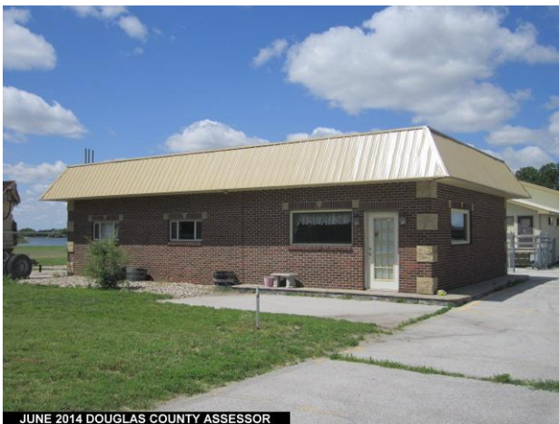
JUNE 2014 DOUGLAS COUNTY ASSESSOR