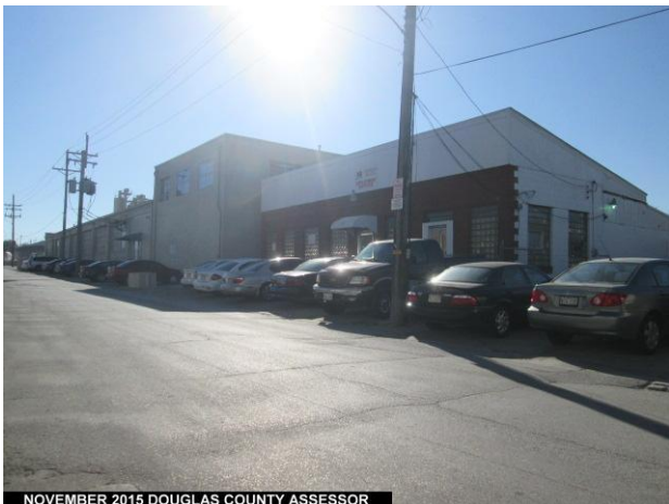
NOVEMBER 2015 DOUGLAS COUNTY ASSESSOR